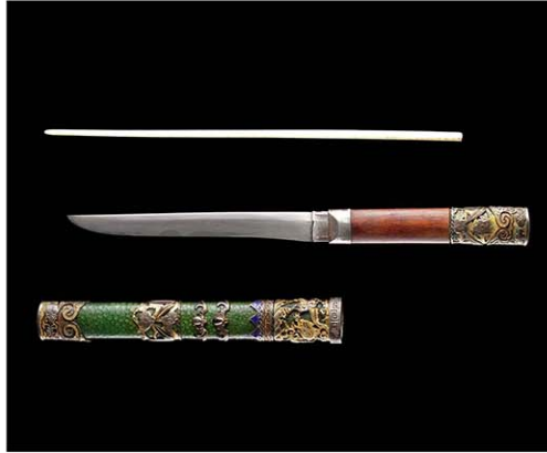
Chinese Eating Knife with Rayskin Covered Scabbard 18th century. Length 25 cm. Runjeet Singh