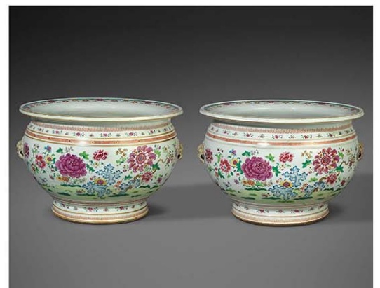
Pair of Porcelain Fish Bowls Qianlong period (1736–1795). Diameters 61.5 cm. Jorge Welsh Works of Art