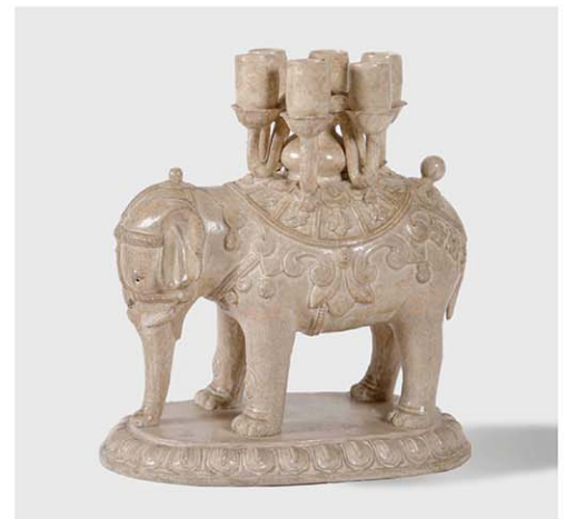
White-Glazed Elephant Candelabrum Tang dynasty (618–907). Height 26.7 cm. Maria Kiang Chinese Art

As always at this time of the year, I am looking forward to the glamour and excitement of various upcoming Asian art shows. Readers may like to note in their diaries the following prestigious events: Parcours des Mondes in Paris (September 12th to 17th); Fine Art Asia in Hong Kong (September 30th to October 3rd); TEFAF New York Fall (October 28th to November 1st); and Asian Art in London (November 2nd to 11th).