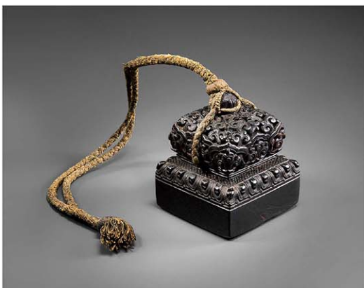
Seal of a Dignitary Yuan dynasty. Carved wood. 5 x 5 cm. Tenzing Asian Art