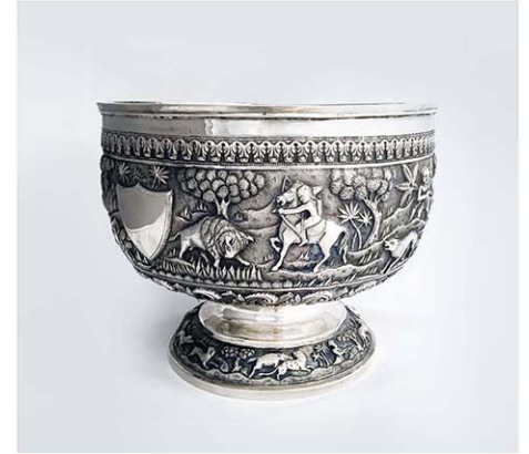
Indian Silver Punch Bowl Late 19th century. Diameter 25 cm. Esmé Parish Silver