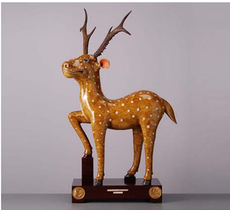
Porcelain Standing Deer Tongzhi period (1862–1874). Height 42 cm. Vandervan Oriental Art