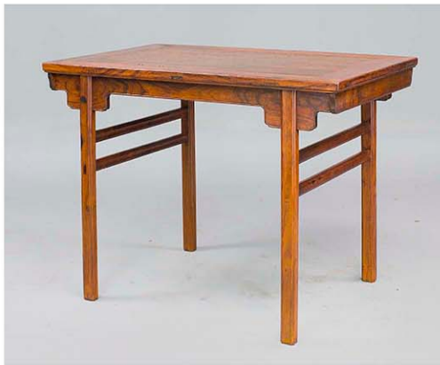
Huanghuali Detachable Painting Table 17th century. 108 x 69 x 81 cm. Andy Hei Ltd