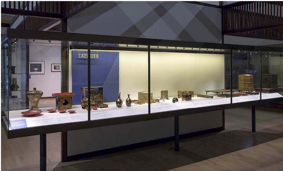
The Victoria and Albert Museum is currently preparing for an exciting display, opening on October 1st, 2017, titled "Lustrous Surfaces: Lacquer in Asia and Beyond"