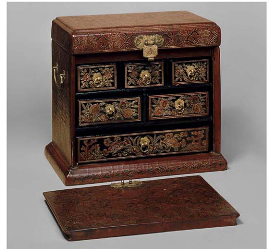
Cabinet with drop front. Polychrome lacquer on wood, with details incised and gilded, gilded metal fittings with tianqi decoration. China, circa 1522–1566. Height 25.4 cm. V&A, FE.88-1974. Given by Sir Harry and Lady Garner.