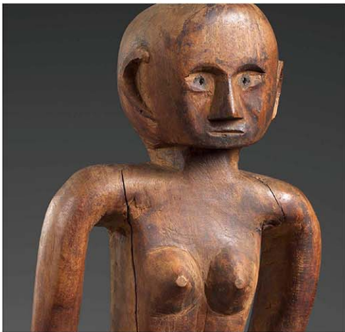
Anadeo Ancestor Figure, Lio People, Flores, 19th–early 20th century. Wood. Height 76 cm. Thomas Murray