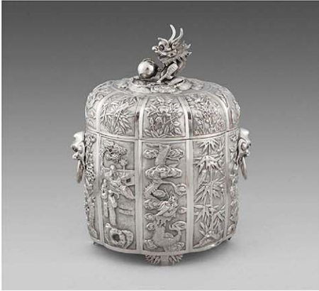
Chinese Export Silver Canister Circa 1835. Height 23.5 cm. Koopman Rare Art