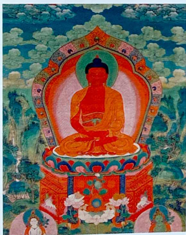
Amitabha Buddha From Xumi Fushou Temple, Chengde, China Qianlong period, 1779–80 Distemper on cloth, 135.9 x 82.2 cm Rossi & Rossi

Francisco-based gallery Tenzing Asian Art , which handles iconic Buddhist and Hindu works of art from renowned collections, will be displaying an 11th century bronze figure of Kubera or Jambhala with gold and silver inlay from Pala India. Also dealing in art from India as well as from China and the Himalayas, Walter Arader Himalayan Art of New York will be offering a four-armed Avalokiteshvara from 15th century Tibet in copper alloy with silver and copper inlay.