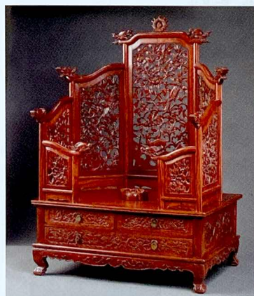
Mirror stand China, early Qing dynasty (1644–1911) Huanghuali , 97 x 66.5 x 48.5 cm Ever Arts