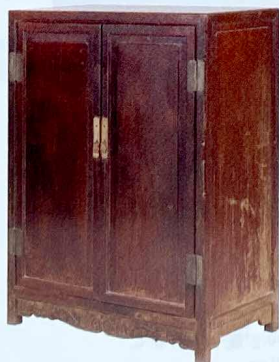
Book cabinet China, Ming dynasty, 17th century Huanghuali , 113 x 85 x 47.5 cm Andy Hei