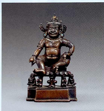
Kubera or Jambhala India, Pala period, 11th century Bronze with gold and silver inlay, height 7 cm Tenzing Asian Art