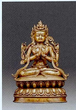
Avalokiteshvara Tibet, 15th century Copper alloy with silver and copper inlay, height 21 cm Walter Arader Himalayan Art