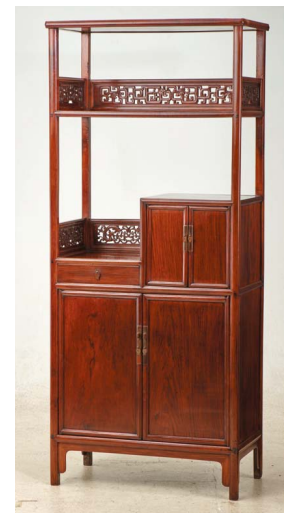
Display cabinet China, early Qing dynasty (1644–1911) Huanghuali , 185 x 78 x 42 cm Ever Arts

will be the focus of his exhibition at the fair this year, with a 16th century carved cinnabar stem cup and a 15th century 'peony and lingzhi ' lidded box among the highlights. Ever Arts will be showing a