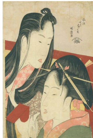
Winter Cherry , from the series 'Seven Fashionable Bad Habits'