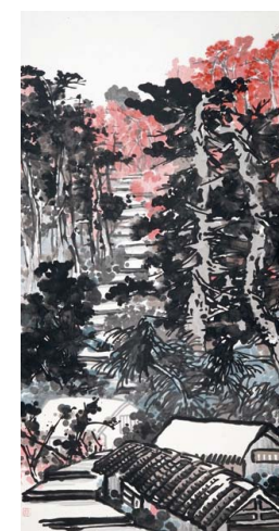
Guanyin Grotto By Lui Shou-kwan (1919–75) Ink and colour on rice paper Alisan Fine Arts

Among the exhibitors is Alisan Fine Arts , whose show will focus on landscape paintings by six artists