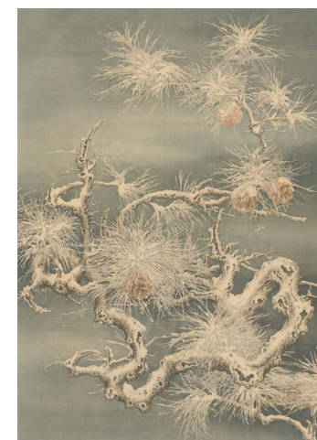
Pine, Bamboo and Plum – Pine By Ren Zhong (b. 1976) Ink on silk, 99 x 67.5 cm Chelesa Art

selection of Ming furniture and bamboo scholar's objects. Noteworthy are an early Qing dynasty bamboo brushpot carved with a scene from the Yuan dynasty drama Romance of the Western Chamber and a huanghuali display cabinet from the same era. Chelesa Art will present a solo exhibition by the ink painter Ren Zhong. Meticulously composed, Ren Zhong's paintings are a distillation of ancient wisdom, as well as being stylistically innovative and original. The show will feature a selection of his recent works.