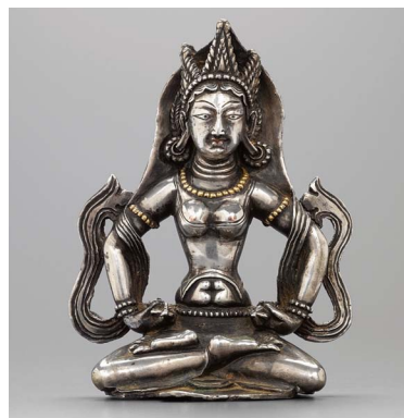
Female aspect of Vajrasattva Kashmir, 11th century Silver with gold and copper inlay, height 11 cm Tenzing Asian Art

Tenzing Asian Art will be exhibiting works covering the entire Himalayan region, from sculptures in stone, wood and metal to paintings of deities, bodhisattvas and teachers, all from the Vajrayana or tantric path of Buddhism. Highlights include an image of the female aspect of Vajrasattva from 11th century Kashmir. Cast in silver with gold and copper inlay and inscribed in Sanskrit on the base, the statue is identical in design and workmanship to two sculptures that were part of a Vajradhatu mandala, one in The Metropolitan Museum of Art and the other in a US private collection. The fact that the image is made of silver suggests a royal commission.